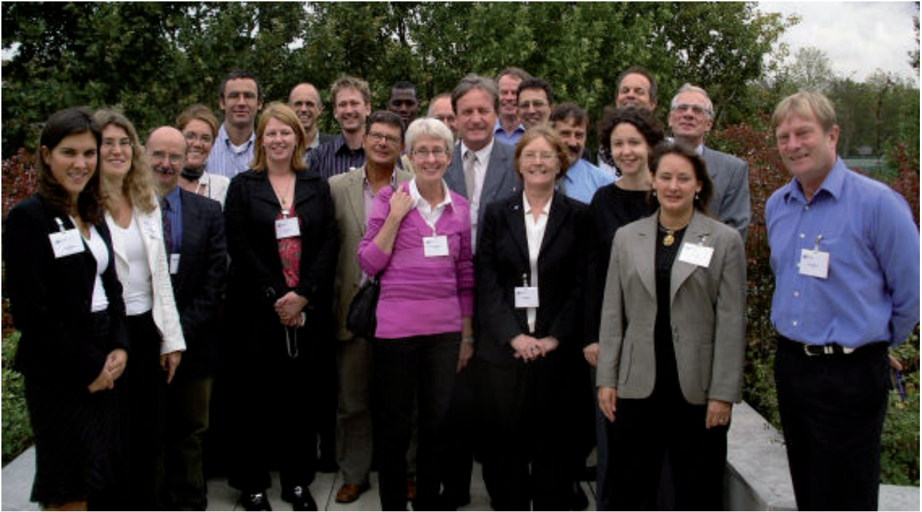
Co-ordinating Forum Participants, AFSSA, 28 September 2005