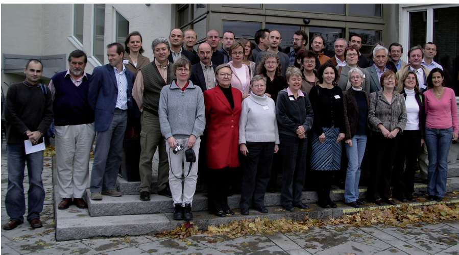
Thematic Meeting participants, Uppsala, 19-21 October 2005

The next General Meeting At the Co-ordinating Forum and Governing Board meetings, enthusiastic approval was given to hold the next General meeting in Malta, probably in mid May next year.